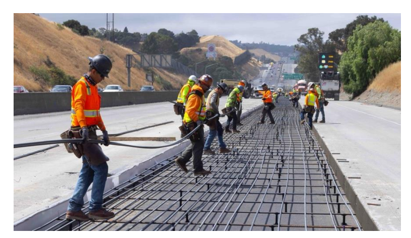
Pavement & Bridge Rehabilitation