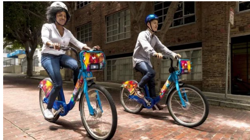
Bay Wheels bikeshare