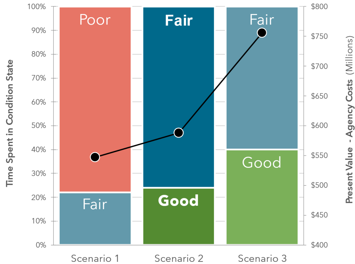
Scenario planning for a sample bridge