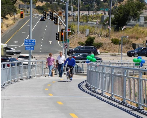
North-South Greenway Segment over Corte Madera Creek opened July 2022