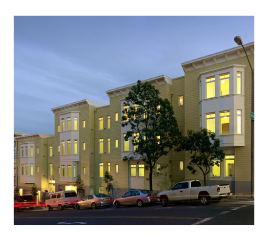
Zygmunt Arendt House, San Francisco

Innovation requires accepting and planning for risk. Too often, investment in emerging developers embedded in impacted communities is deemed too great of a risk because they have not yet established enough of a track record for traditional development. Stakeholders reported that this dynamic fails to recognize the value of community-controlled development organizations and reinforces the structural barriers that limit the self-determination of BIPOC and impacted communities. BAHFA could accept a small level of risk, for example, by creating a loan loss reserve to underwrite promising nascent organizations, which builds in a plan for a small percentage of potential loss. Additionally, BAHFA can incentivize partnerships between established and emerging or community-based developers to grow the capacity and track record of the latter.