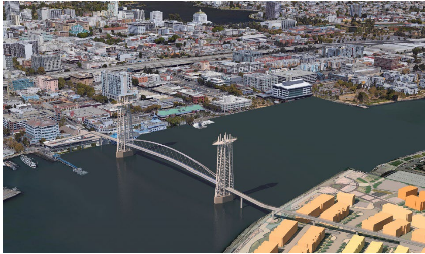
Rendering of the proposed Oakland-Alameda Bicycle/Pedestrian Bridge

improvements connecting the Posey Tube to Interstate 880, called the Oakland Alameda Access Project, and is expected to be completed in 2027.