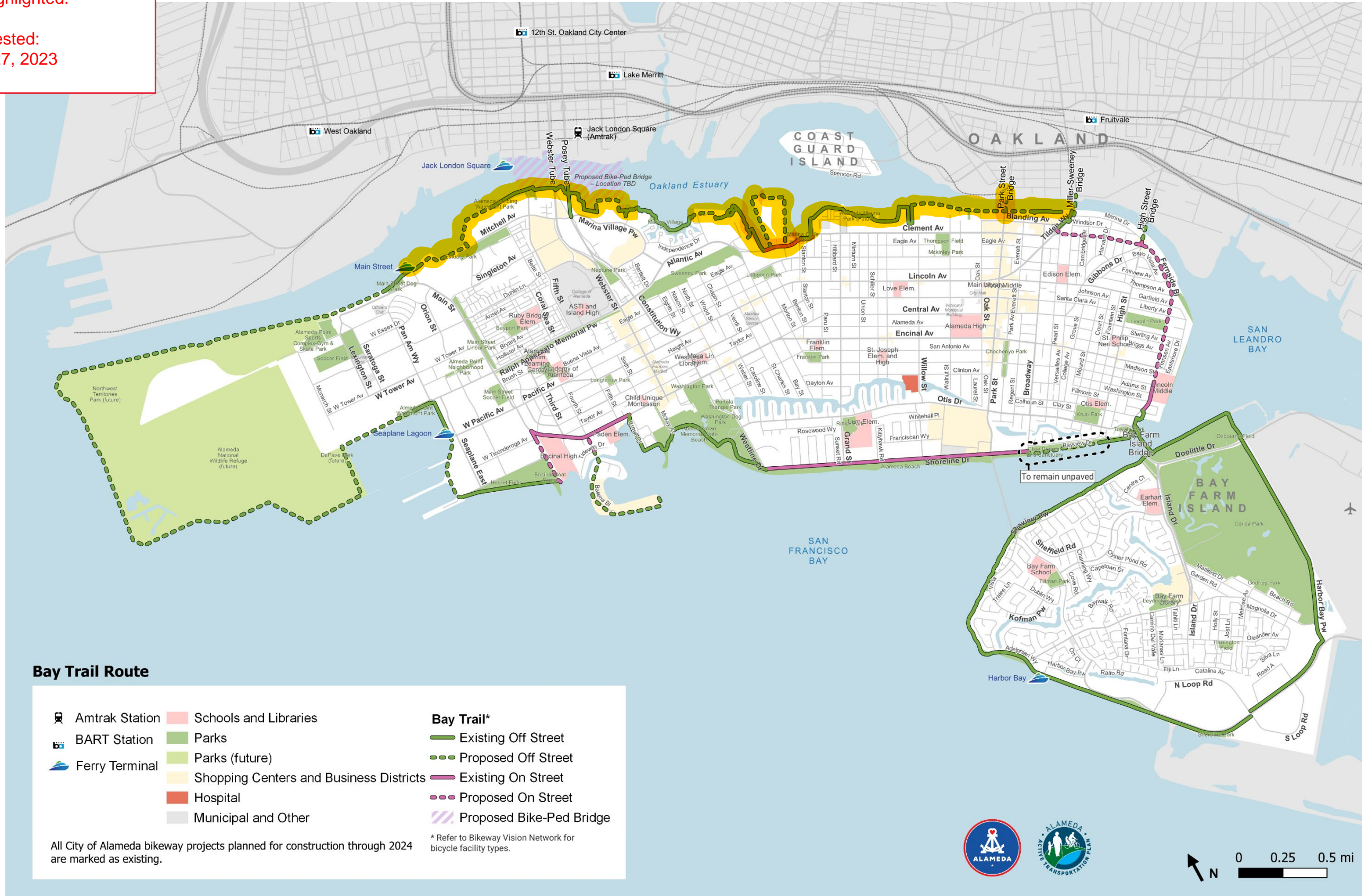
Figure 9. Bay Trail Route