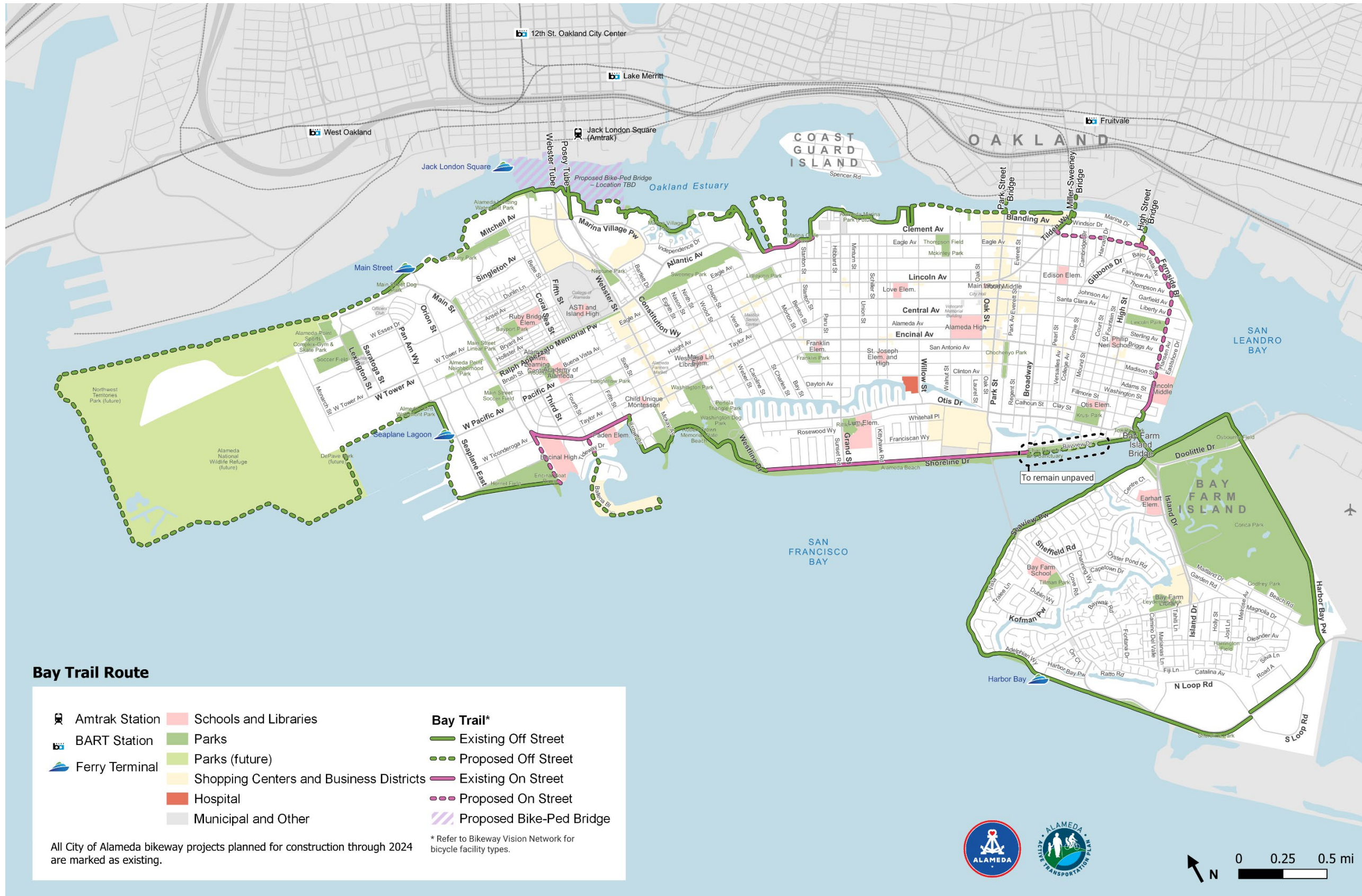
Figure 9. Bay Trail Route