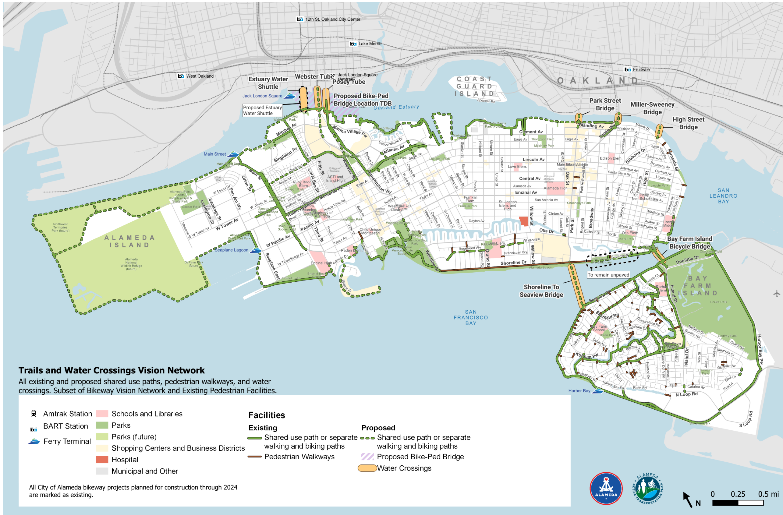
Figure 8. Trails and Water Crossings Vision Network