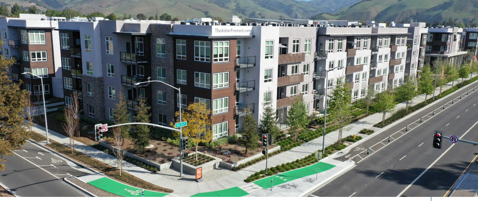
The Asher in Fremont