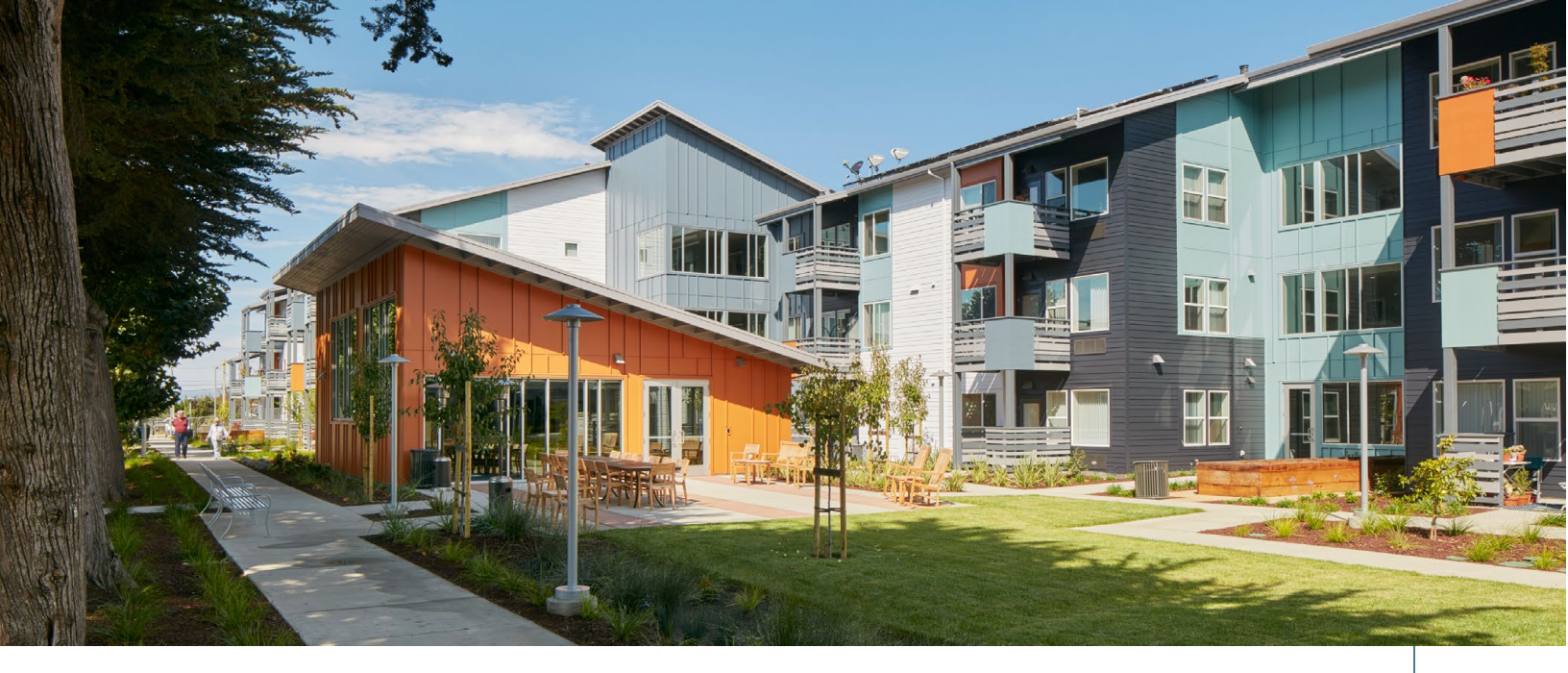
Half Moon Village in Half Moon Bay