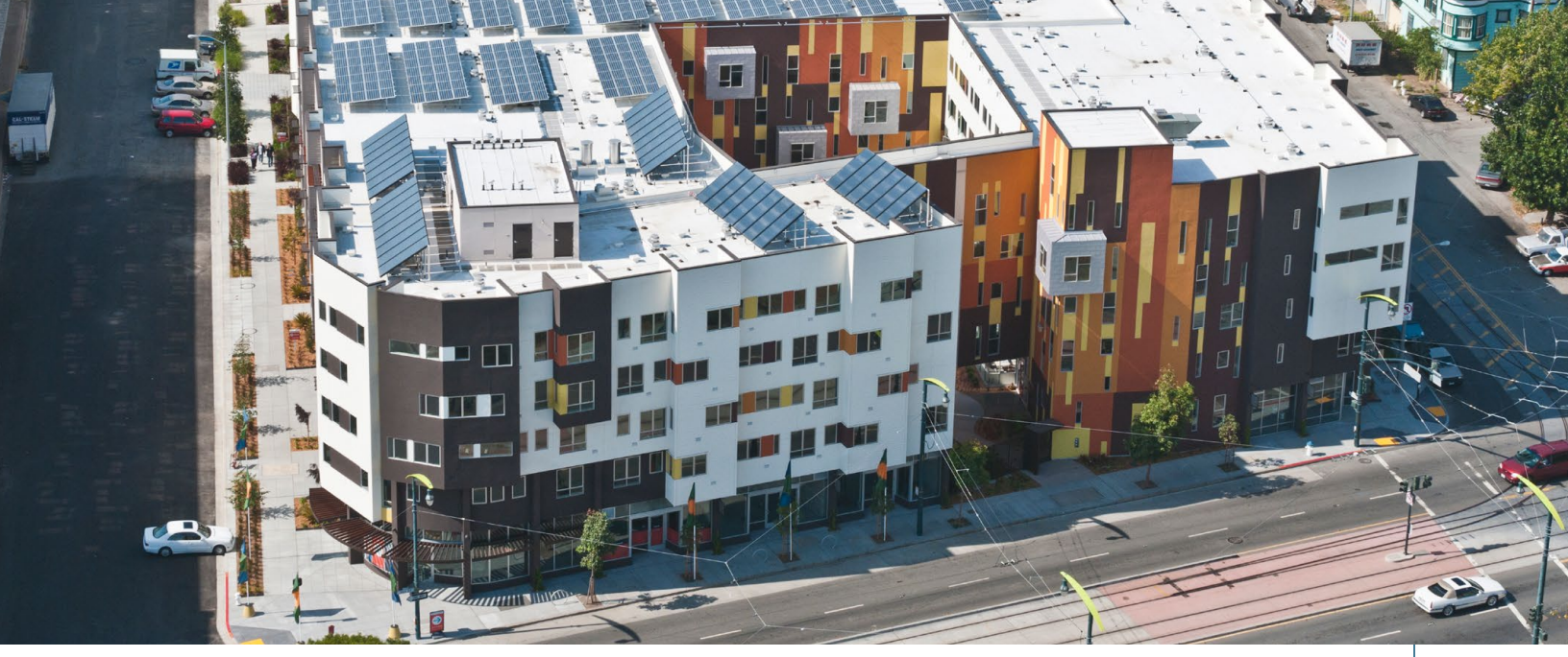
Armstrong Place Senior Housing and Armstrong Townhomes in San Francisco