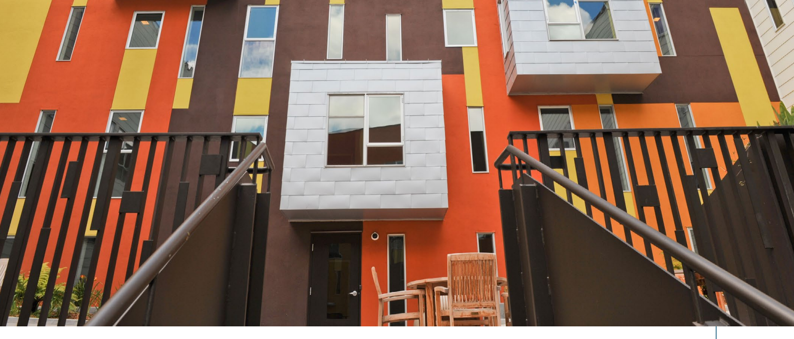
Armstrong Place Senior Housing in San Francisco