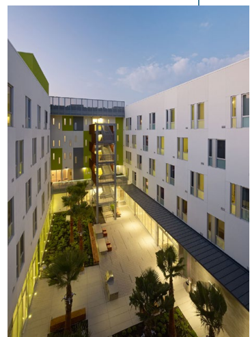
Drs. Julian & Raye Richardson Apartments in San Francisco

A comprehensive set of strategies that account for the particular capacities and barriers of every community will allow BAHFA to move the region toward a future where every Bay Area resident can thrive with a safe and affordable home. A future where residents from all walks of life – teachers, first responders, and service workers, families, veterans, and people with disabilities – are free to pursue their dreams, feel connected to their neighborhoods, and access the amenities that make the Bay Area such a great place to live. A future where the Bay Area's racial and ethnic diversity is preserved and recognized as one of its core strengths, where everyone – Black and white, Latinx and Asian, and Indigenous – can comfortably call the Bay Area home.