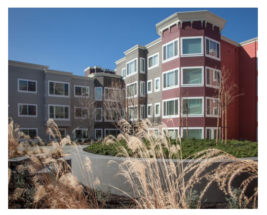
Fell Street Apartments in San Francisco

One potential opportunity for BAHFA to explore is the use of mixed-income housing models, with higher-income units that can cross-subsidize ELI units. Facilitating the creation of integrated, mixed-income housing for people with disabilities (rather than segregating ELI and accessible housing in separate buildings) can also be a potential strategy for