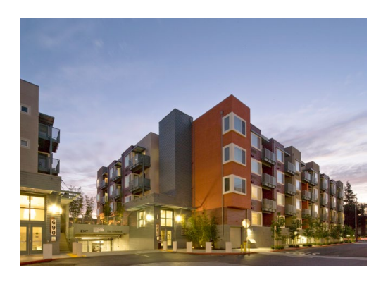
Fair Oaks Plaza in Sunnyvale

Stakeholders stressed the importance of protection programs that reduce people's vulnerability to displacement before reaching a crisis point of becoming unhoused. Recommendations for upstream interventions include permanent housing subsidies, expanded outreach and education programs that raise awareness of tenants' rights as well as available financial and legal resources, and overall strengthening of the region's institutional infrastructure (across public, nonprofit, and legal services agencies) to deliver these and other essential forms of support. Some of