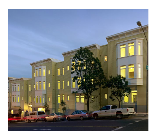
Zygmunt Arendt House, San Francisco

Innovation requires accepting and planning for risk. Too often, investment in emerging developers embedded in impacted communities is deemed too great of a risk because they have not yet established enough of a track record for traditional development. Stakeholders reported that this dynamic fails to recognize the value of community-controlled development organizations and reinforces the structural barriers that limit the self-determination of BIPOC and impacted communities. BAHFA could accept a small level of risk, for example, by creating a loan loss reserve to underwrite promising nascent organizations, which builds in a plan for a small percentage of potential loss. Additionally, BAHFA can incentivize partnerships between established and emerging or community-based developers to grow the capacity and track record of the latter.