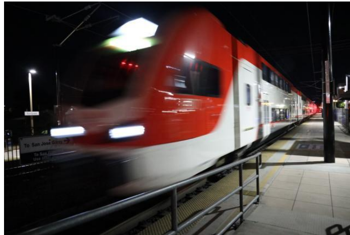
Caltrain Electric Trainset Full-Speed Test in September 2023