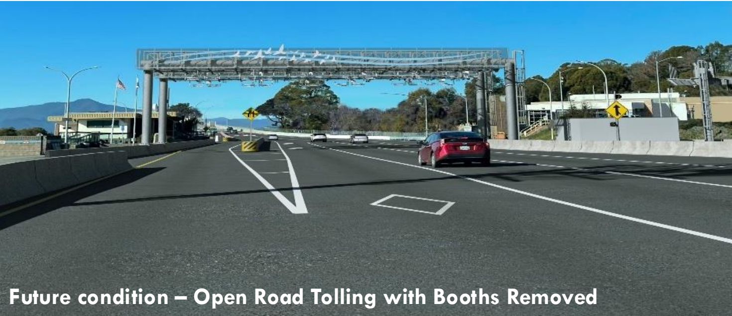
Future condition – Open Road Tolling with Booths Removed