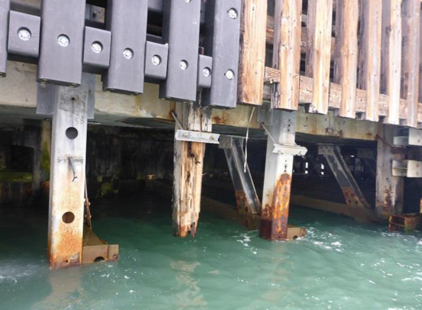
San Francisco-Oakland Bay Bridge fender repair