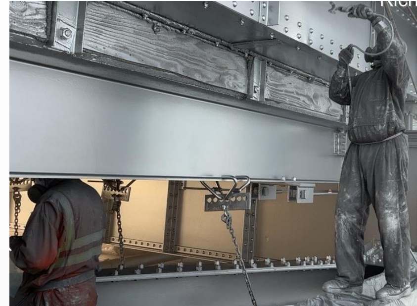
Richmond-San Rafael paint