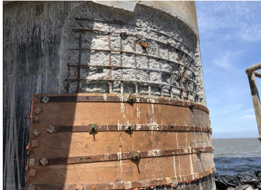
San Mateo-Hayward Bridge over water concrete repair