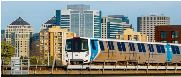
BART train travels through Oakland.

In 2023, the Legislature adopted SB 125, a $5.1 billion multi-year transit funding package designed to stabilize transit operations and advance critical modernization projects. Nearly