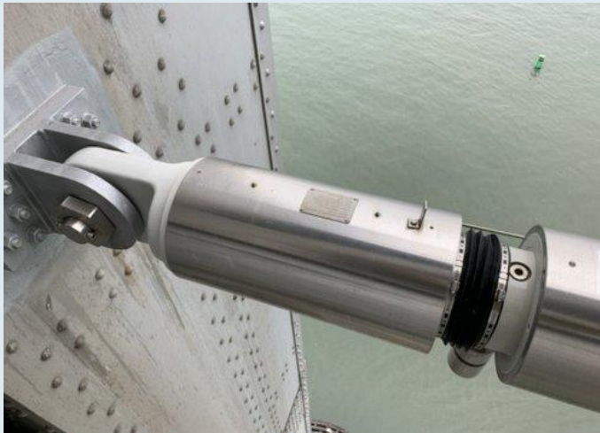
Conclusion of Seismic Program

Reflecting Changes to Toll Bridge Management