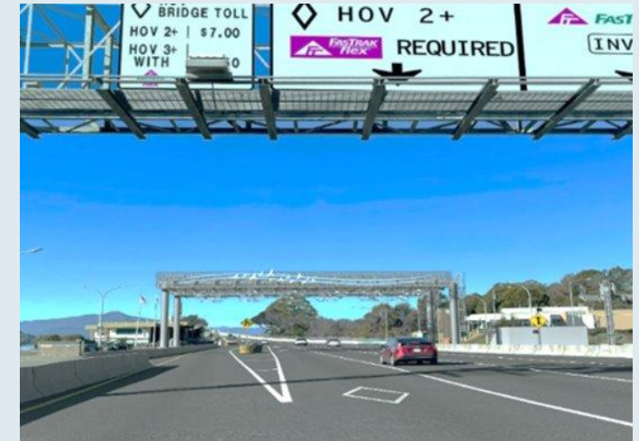
Electronic Toll Collection