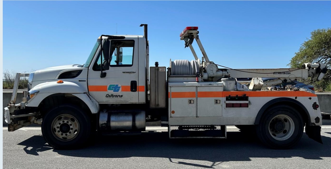
Funding for Toll Bridge Tow Services