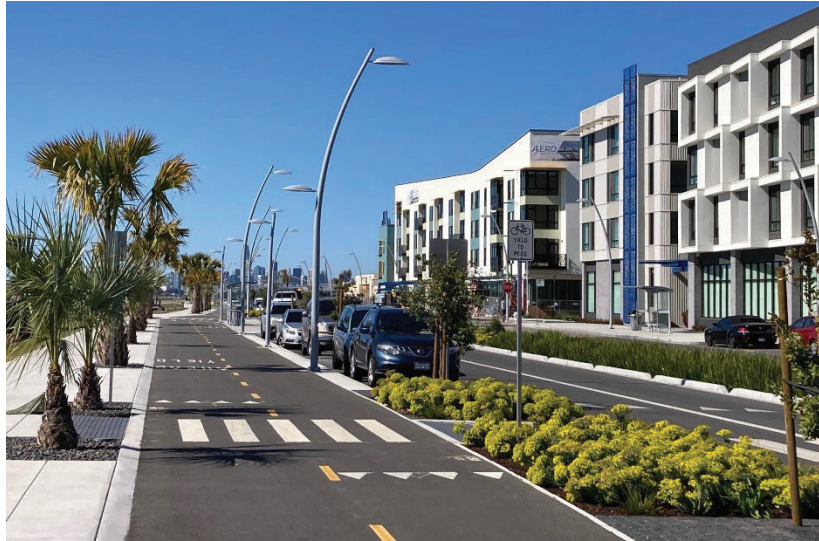
Cross Alameda Trail along West Atlantic Avenue