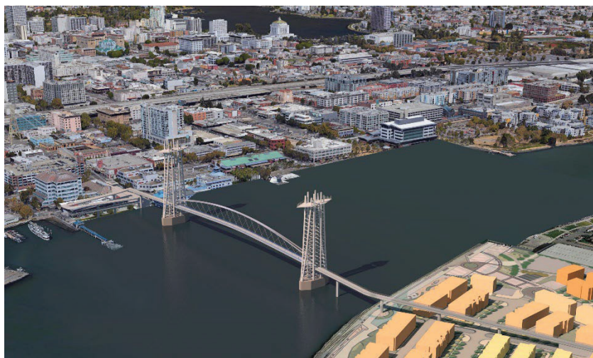
Rendering of the proposed Oakland-Alameda Bicycle/Pedestrian Bridge

improvements connecting the Posey Tube to Interstate 880, called the Oakland Alameda Access Project, and is expected to be completed in 2027.