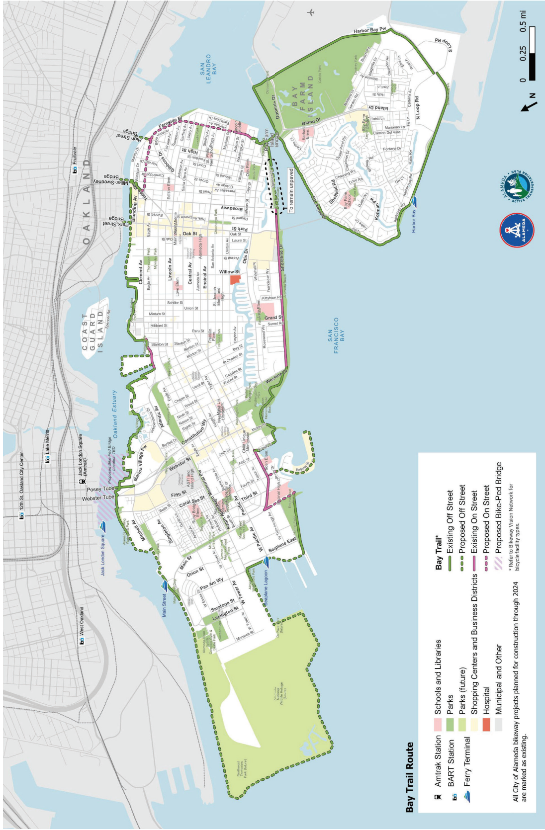
Figure 9. Bay Trail Route