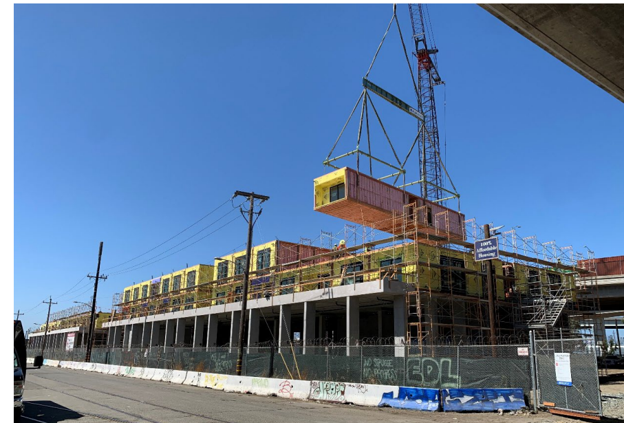
Image: Modular housing project in San Leandro