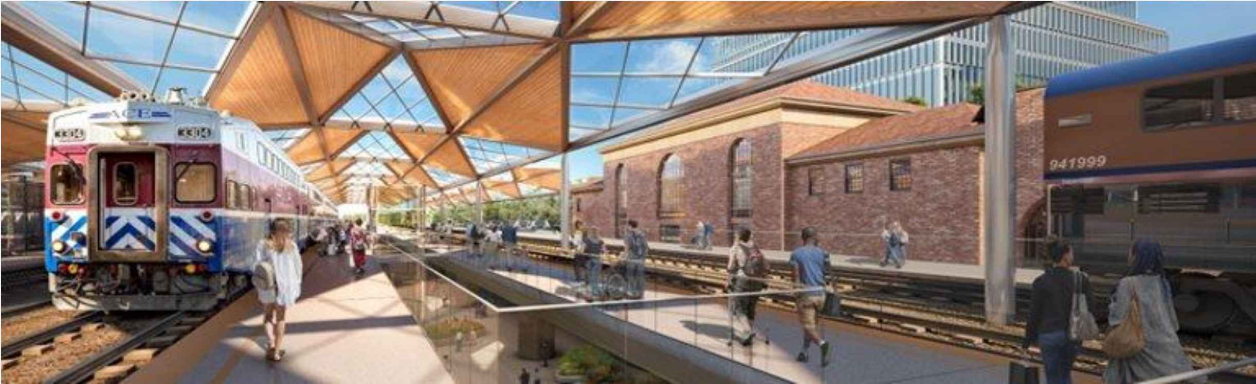
Illustrative only—VTA rendering of future Diridon Station