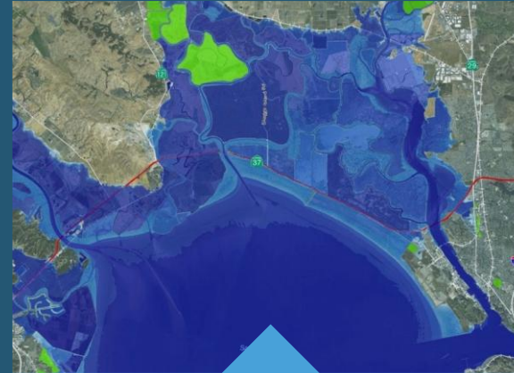
Flooding/ Sea Level Rise