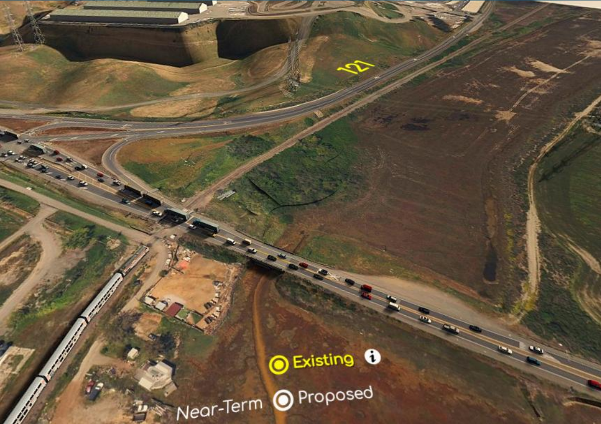
Existing Tolay Bridge