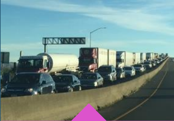
Travel Time & Transit