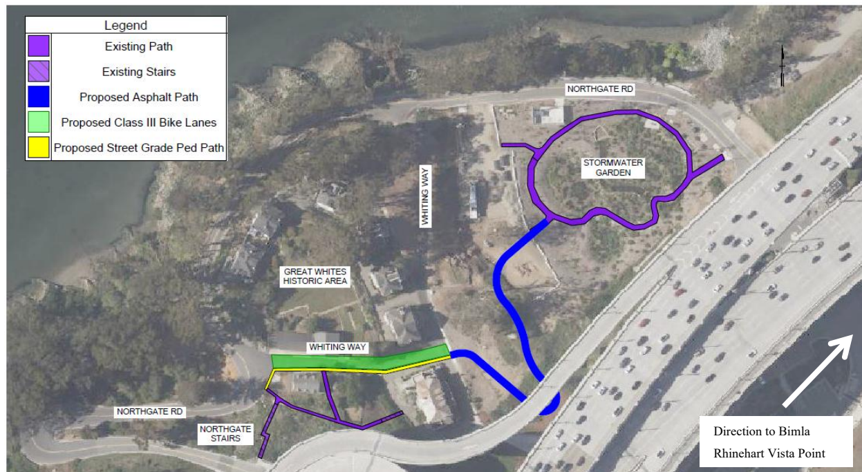
Illustration B: Pedestrian Access Pathway

As part of the agreements associated with the Bay Bridge East Span Seismic Replacement Project, Caltrans and BATA are also responsible for providing a pedestrian pathway that will connect the Northgate Road to the Bimla Rhinehart Vista Point. The proposed plan includes constructing a short segment of pathway linking the existing staircase to Whiting Way. Along Whiting Way, bicycle and pedestrian signage will be installed to indicate a shared roadway. Additionally, an eight-foot-wide path will be built to connect Whiting Way to the Stormwater Garden pathway. Once completed, pedestrians and cyclists will be able to travel from Whiting Way down to the Bimla Rhinehart Vista Point via the new pathway and the Stormwater Garden.