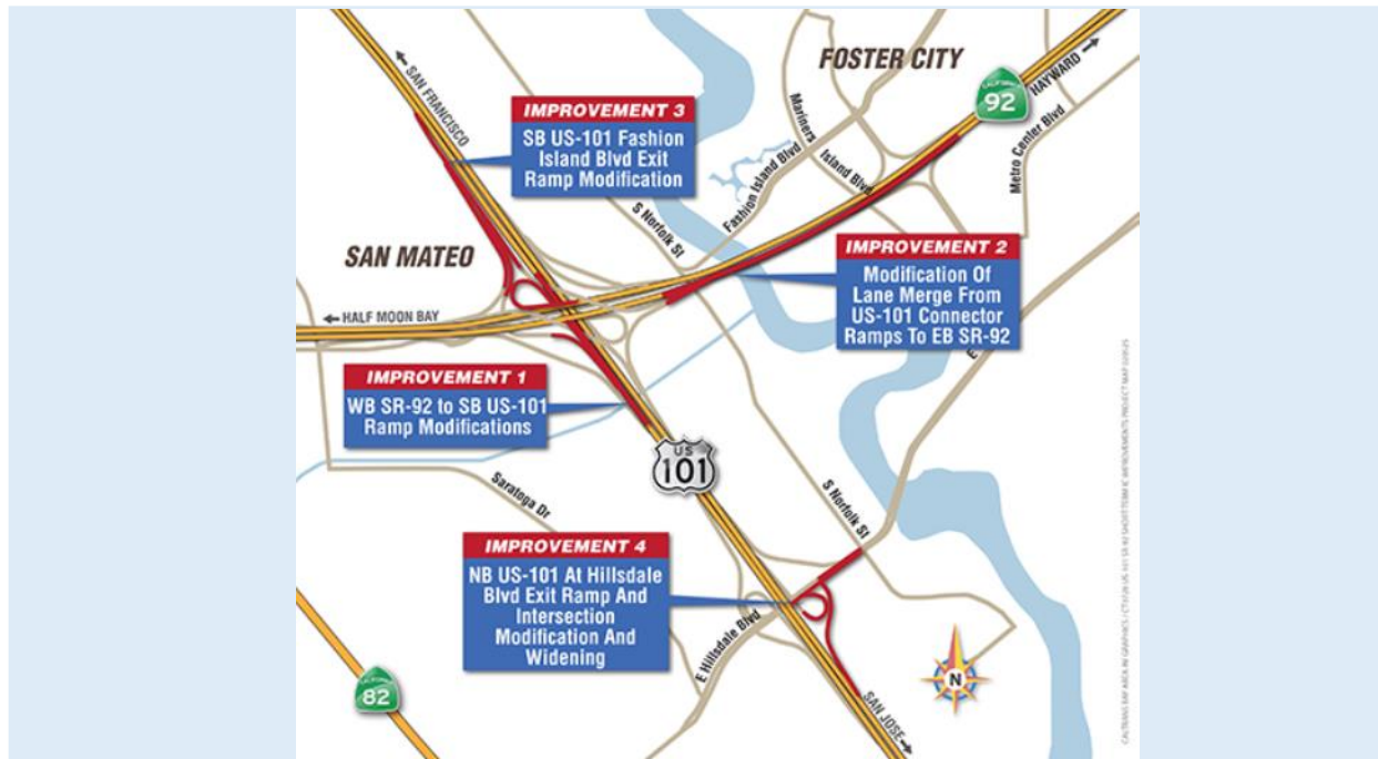
Planned improvements at US 101/SR 92