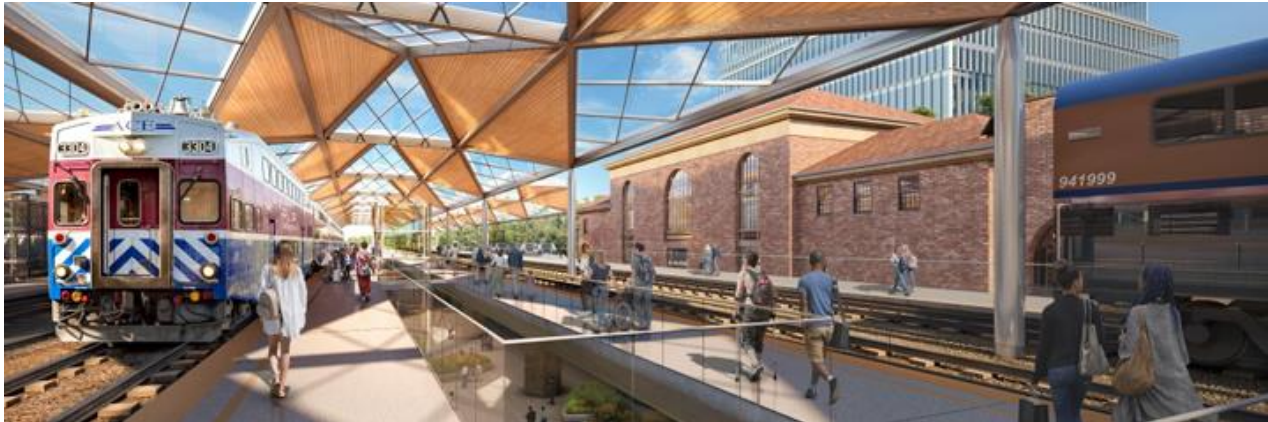
Diridon Station Rendering