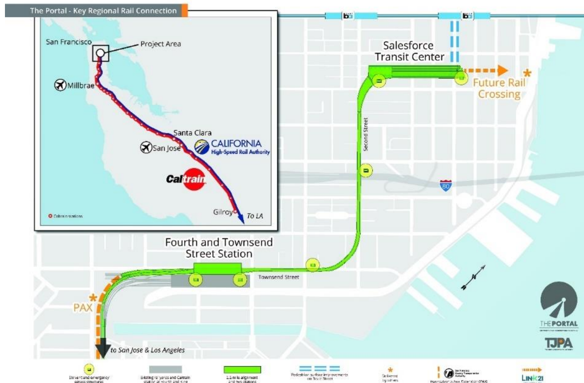
The Portal alignment map