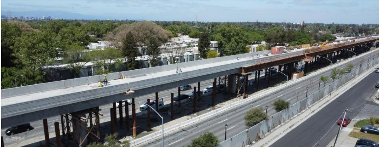
Aerial view of the superstructure under construction VTA images