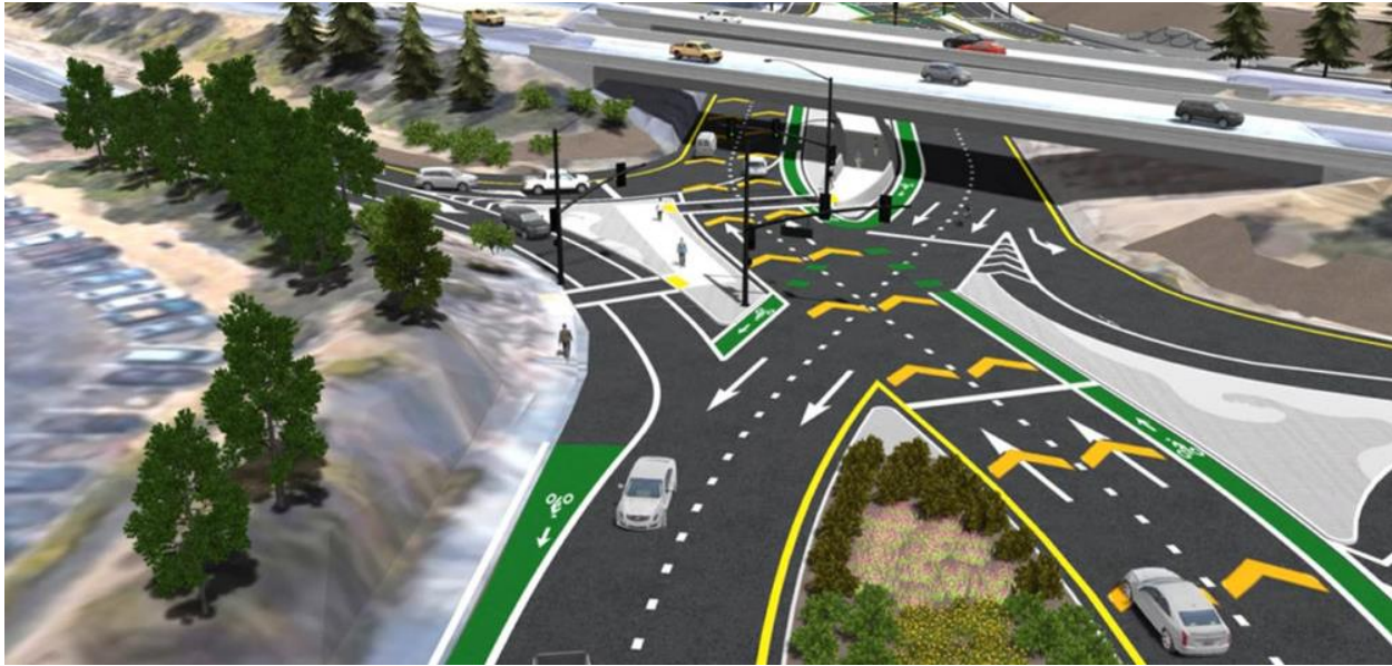
Rendering of the SR 37 Diverging Diamond Interchange Image: Solano Transportation Authority