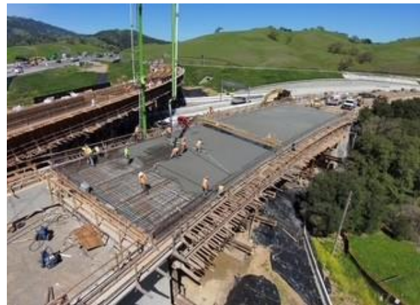
Construction progress on I-680/SR 84 Interchange Photos: Alameda County Transportation Commission