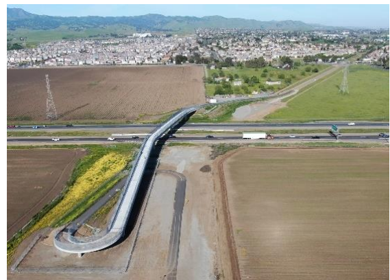
Mokelumne Trail Bicycle/Pedestrian Overcrossing of State Route 4.