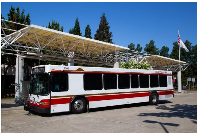
County Connection buses purchased with RM 3 funds