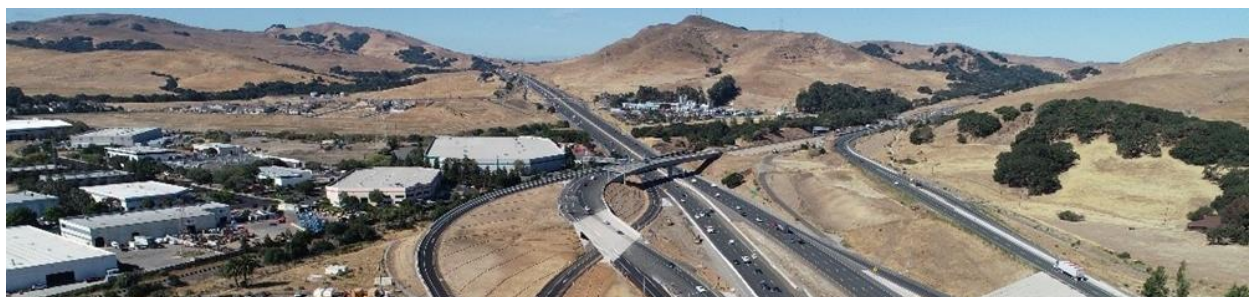
First RM3-funded construction package for the I-80/I-680/SR 12 interchange in Fairfield.