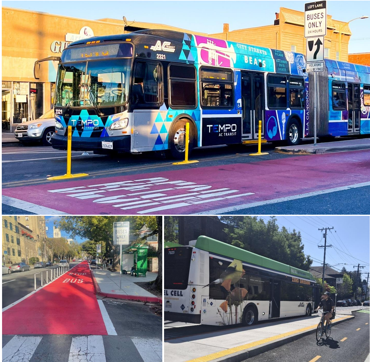
Quick Build improvements and bus delineation on International Boulevard in Oakland (top), Durant Avenue in Berkeley (bottom left), and Dana Street in Berkeley (bottom right):