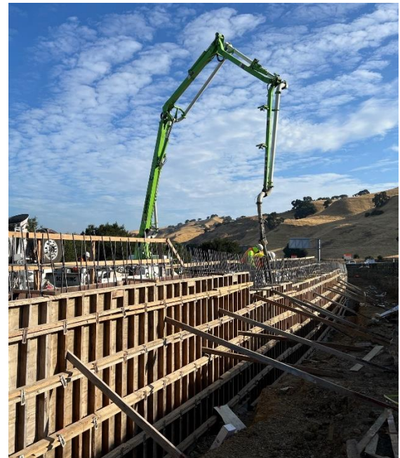
Left: Map of Bay Area Express lanes showing lanes under construction in Solano and Alameda Counties. Right: Construction photo of I-680 express lanes