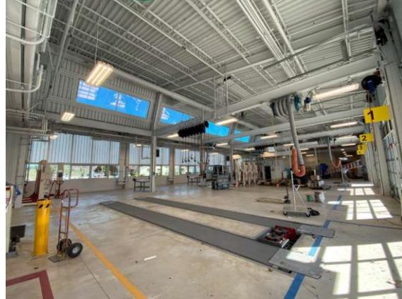
Napa Vine Transit Maintenance Facility