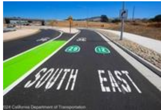
SR 29/Soscol Junction. Top: Photo of Soscol Junction Roundabout. Left: Photo of Soscol Junction Flyover Connector. Right: Photo of Soscol Junction bike lanes.