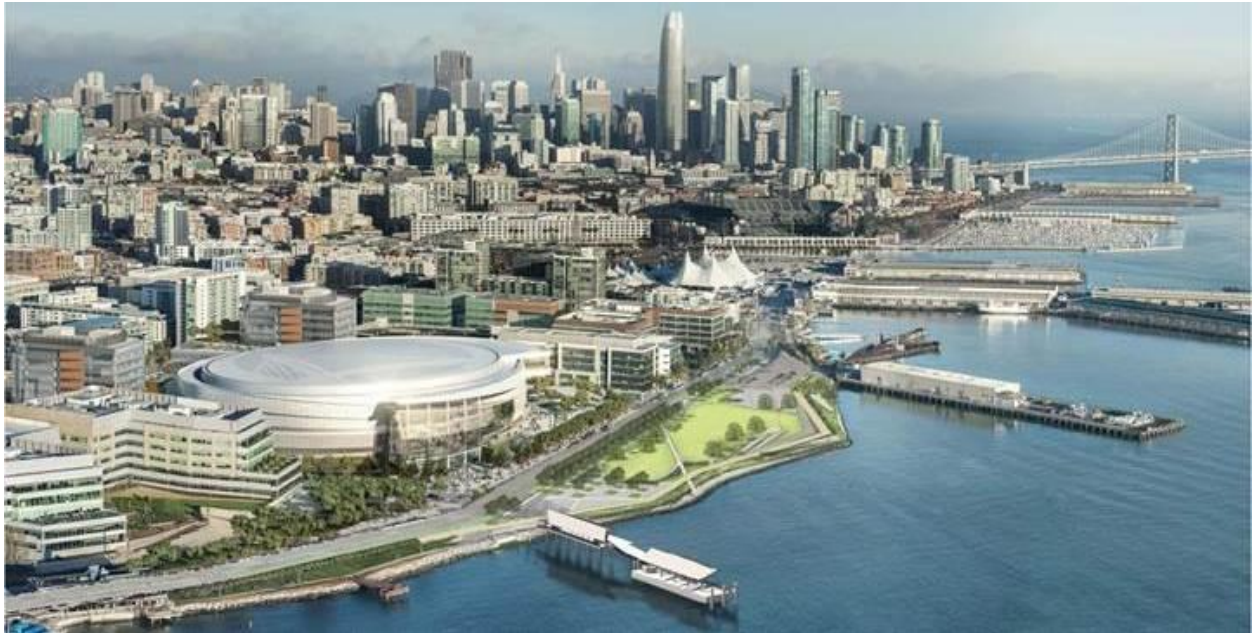
Rendering of the Mission Bay Ferry Landing