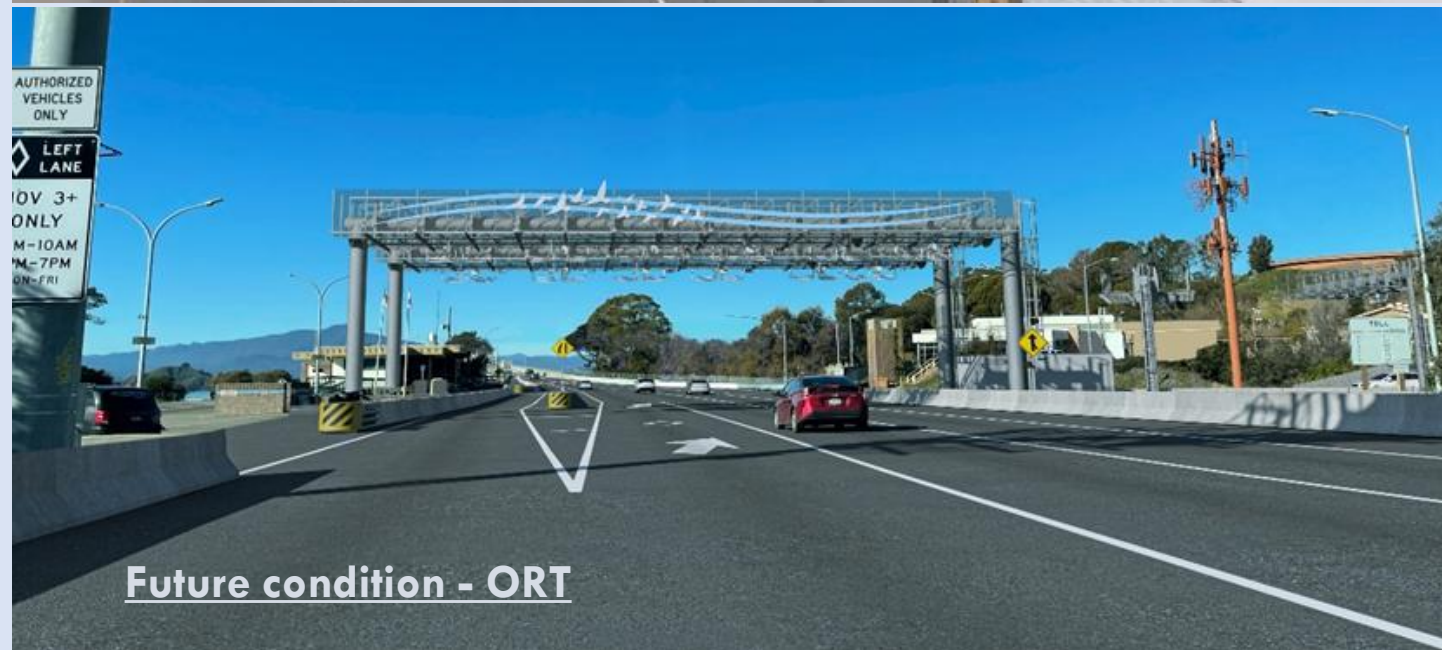
Future condition - ORT