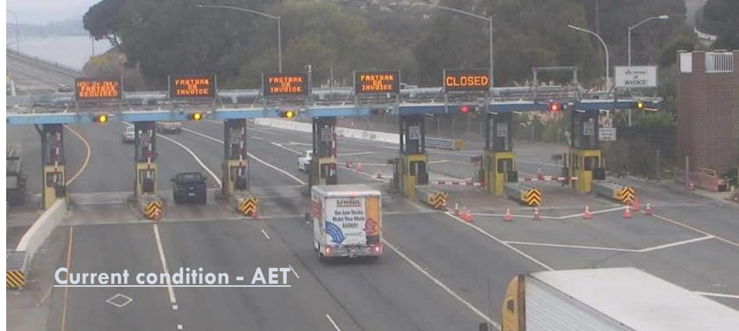
Image Descriptions: First image is the existing Richmond San Rafael Bridge toll plaza with toll booths, and the second image is the proposed toll plaza at Richmond with no toll booths & new overhead gantry.