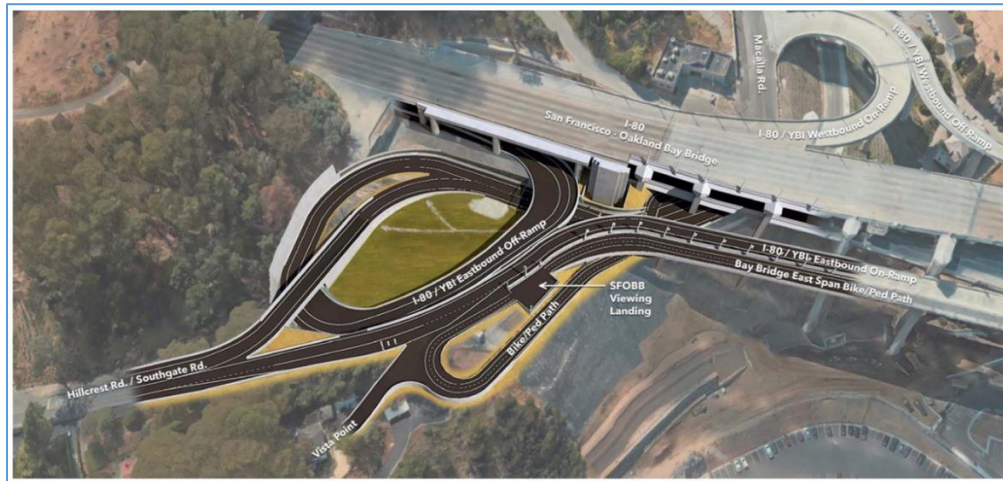
Illustration A: Completed Southgate Road Project

As part of the Southgate Road Project and under a separate contract planned to be advertised in Summer 2024, SFCTA is required to make roof and exterior repairs to the historic Torpedo Building adjacent to the Bimla Rhinehart Vista Point. The Vista Point was constructed as an environmental commitment of the Bay Bridge East Span Seismic Replacement Project. A temporary parking lot was provided while Caltrans and BATA negotiated various permits with stakeholders and complete design of a permanent parking lot. As currently proposed, the permanent lot will have 35 parking spaces, including three Americans with Disabilities Act accessible spaces, and will be at an elevation to accommodate for future sea level rise, remediation, and stormwater run-off. The parking lot will have a restroom facility and joint utility trench through the site for the restroom and to service future development envisioned in the Torpedo Building.