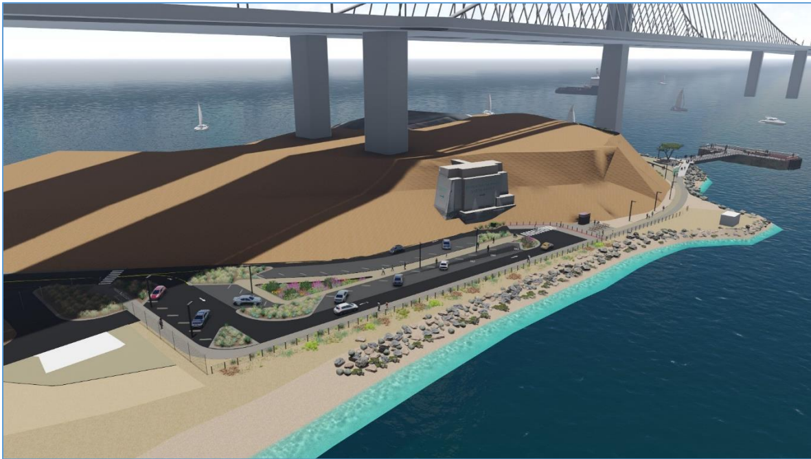
Illustration B: Proposed Bimla Rhinehart Vista Point Parking Lot Project

Given the proximity of both the Torpedo House and permanent parking lot construction activities, BATA, Caltrans and SFCTA staff believe combining the work under a single construction contract presents efficiencies for delivery and avoids the possible conflicts due to multiple contractors having to access through the same work areas. The estimated construction cost of the parking lot and other facilities has been revised to $7 million, increasing the capital estimate from $5 million to $6 million plus a construction management support estimate of $1 million. The capital revision is due to the risk of escalating costs due to inflation. Funding for the Project is budgeted in the Toll Bridge Rehabilitation Program.