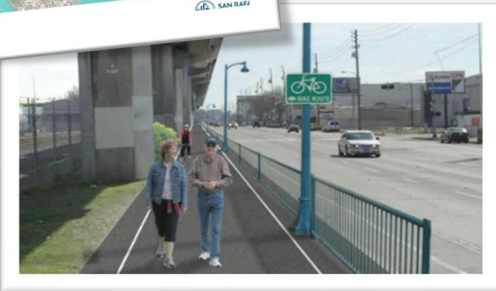
ALA: East Bay Greenway