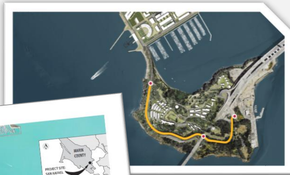
SF: YBI Multiuse Path