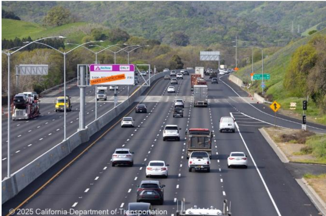
Photo of I-80 new lane with toll system still under construction.