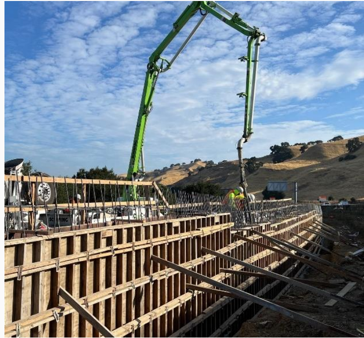
Bay Area Corridor Express Lanes