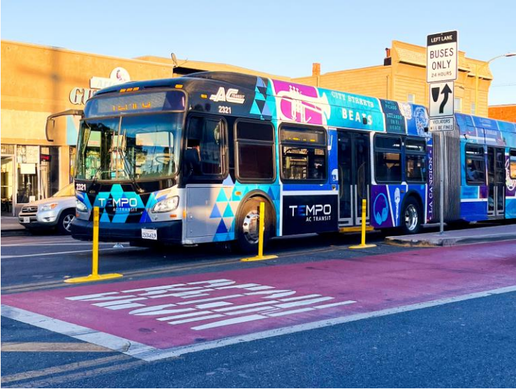
AC Transit Quick Builds, International Boulevard shown