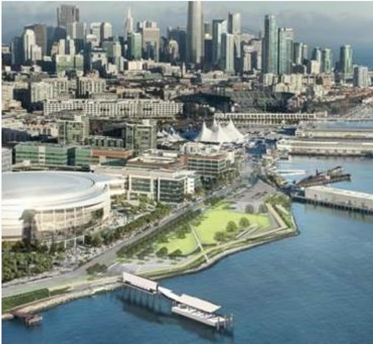
WETA Mission Bay Ferry Landing