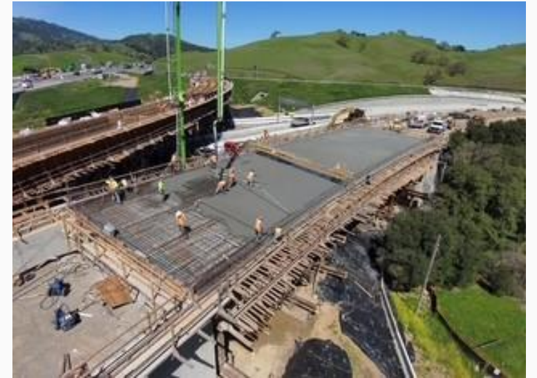
I-680/SR 84 Interchange