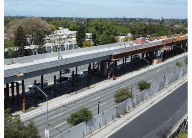
VTA Eastridge to BART Regional Connector