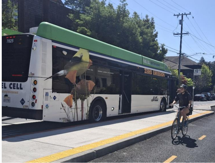
AC Transit Telegraph Rapid, Dana St component shown