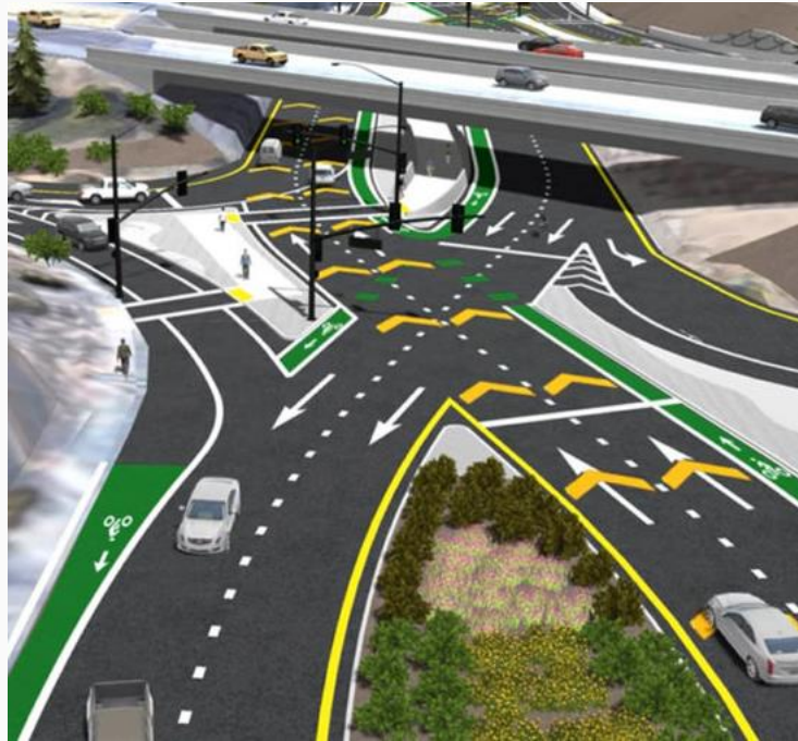
Solano SR 37/ Fairgrounds Drive