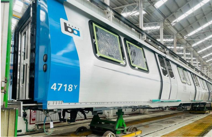
BART Expansion Cars