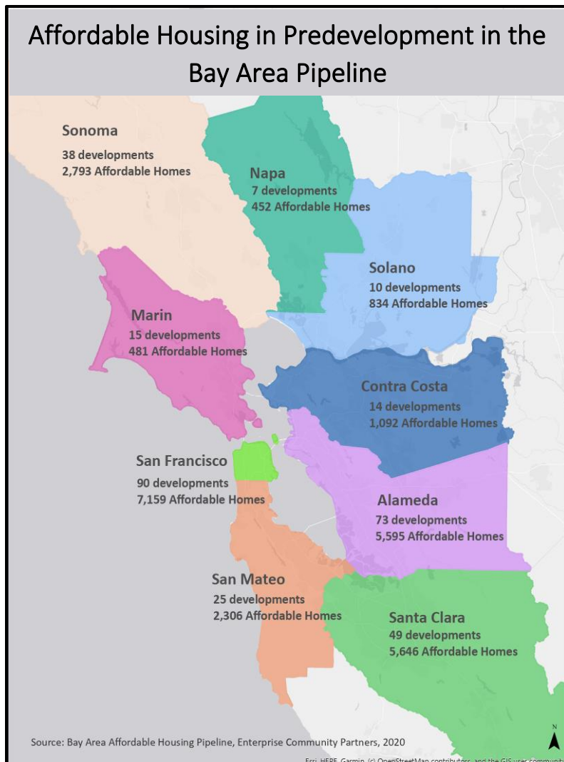
Figure 1. Bay Area Affordable Housing Pipeline by County

The Pipeline is a critical tool in determining how the region is meeting its affordable housing needs, but it can also facilitate systems change for a more effective and efficient affordable housing finance and development system. For example, the Pipeline could be used to create a regional queue for tax credits and bonds. With a managed pipeline, developers know when to apply for local and state funding, often eliminating the need for multiple application rounds which can lower the overall project costs. A managed pipeline increases predictability and helps prioritize local, regional, and state funding. It can identify opportunities and barriers for affordable housing development accounting for geography, type of housing (senior, extremely low-income, multifamily, and so forth), and overall policy considerations like furthering fair housing and advancing climate goals. The Pipeline also can inform funding decisions and build support for new revenue opportunities at the regional, state, and federal levels helping break ground on a transformative regional housing approach.