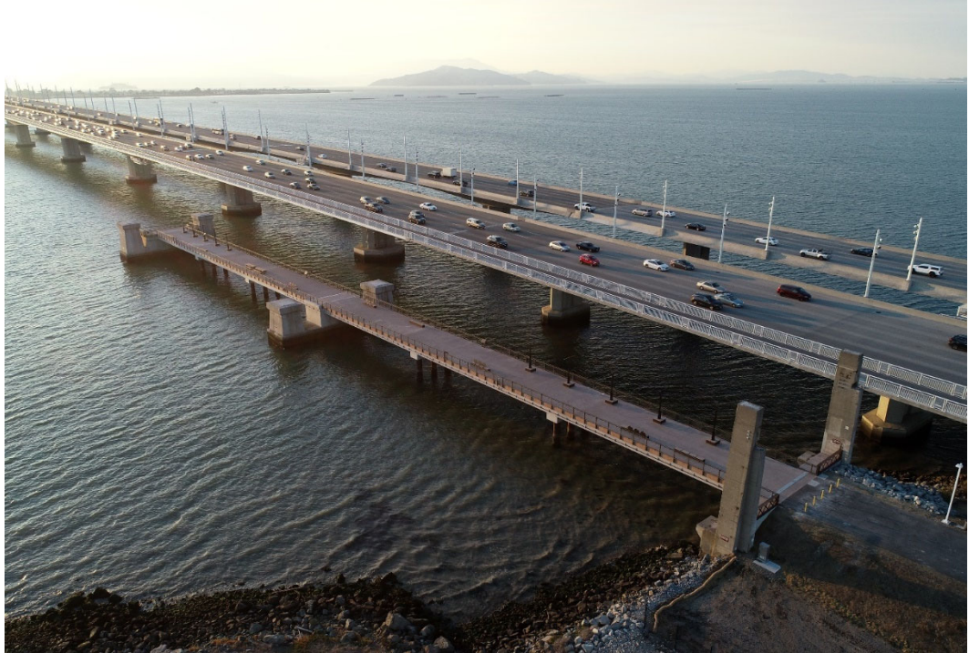
Completed Observation Pier in Oakland

Shoreline Park. Ongoing pier operations and maintenance will be funded from the BATA funds, subject to approval of future BATA budgets.