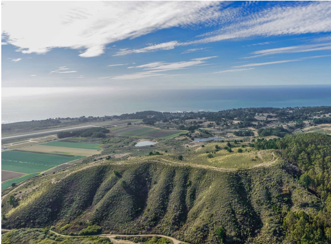
Rancho Corral de Tierra, San Mateo County