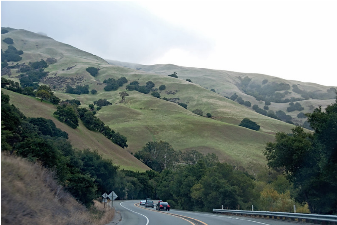
Niles Canyon, Alameda County