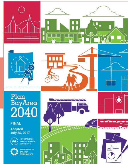
Plan Bay Area 2040 Adopted 2017