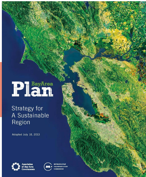
Plan Bay Area Adopted 2013