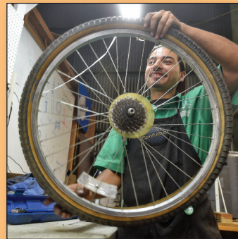
Good Karma Bikes for promoting bicycling (2014)