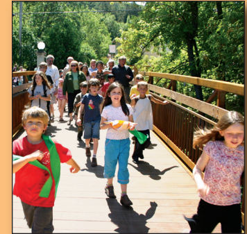
Safe Routes to Schools for improving sidewalks and crosswalks near schools (2010)