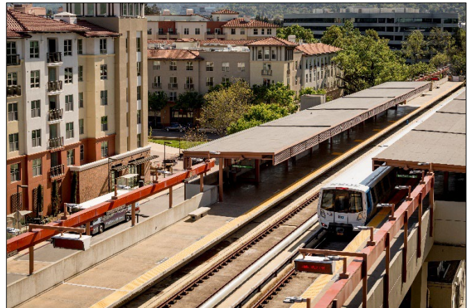
Contra Costa Centre Priority Development Area

The Plan Bay Area 2050+ Growth Geographies are similar to Plan Bay Area 2050 Growth Geographies, with minor refinements to add five new Priority Development Areas and boundary changes to 16 Priority Development Areas approved by ABAG. They also reflect up-to-date information on transit service, natural hazards, and demographics. Areas subject to MTC’s Transit-Oriented Communities Policy are shown as Transit-Rich Areas if not already within a Priority Development Area.