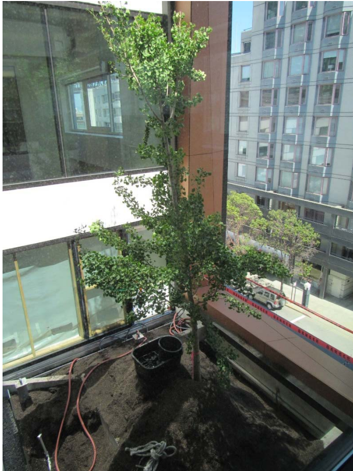
Agenda Item 3 - Attachment A