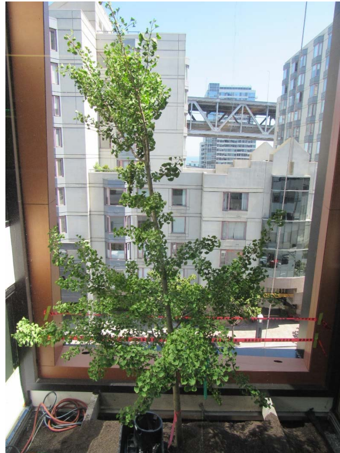
Slide Number 1