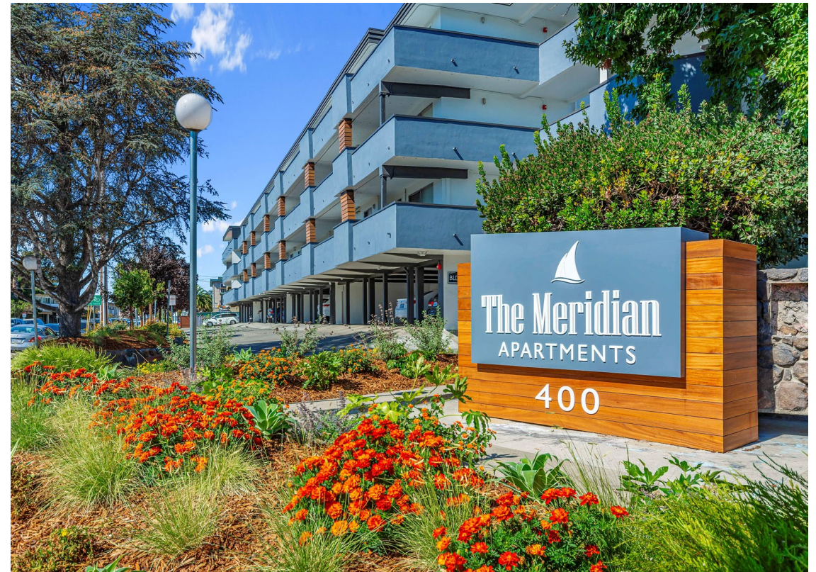
400 Canal Street, Tesseract Capital Group