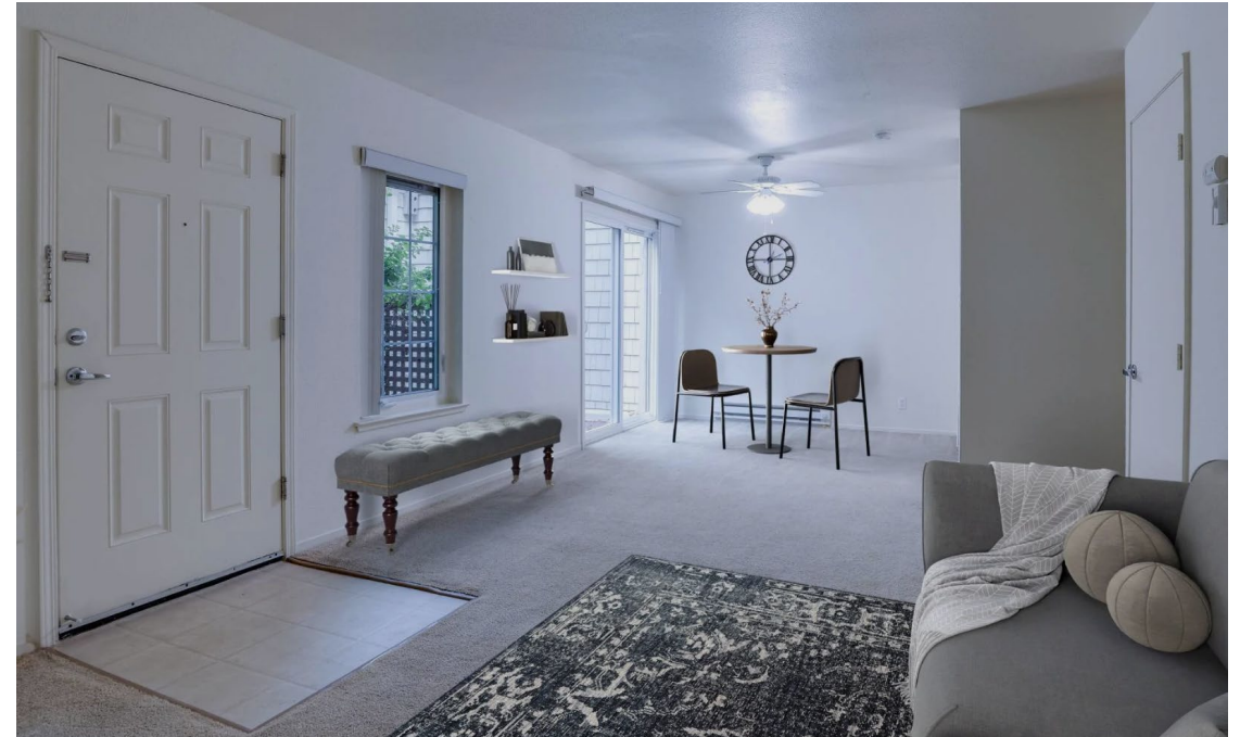
500 King Drive, BRIDGE Housing