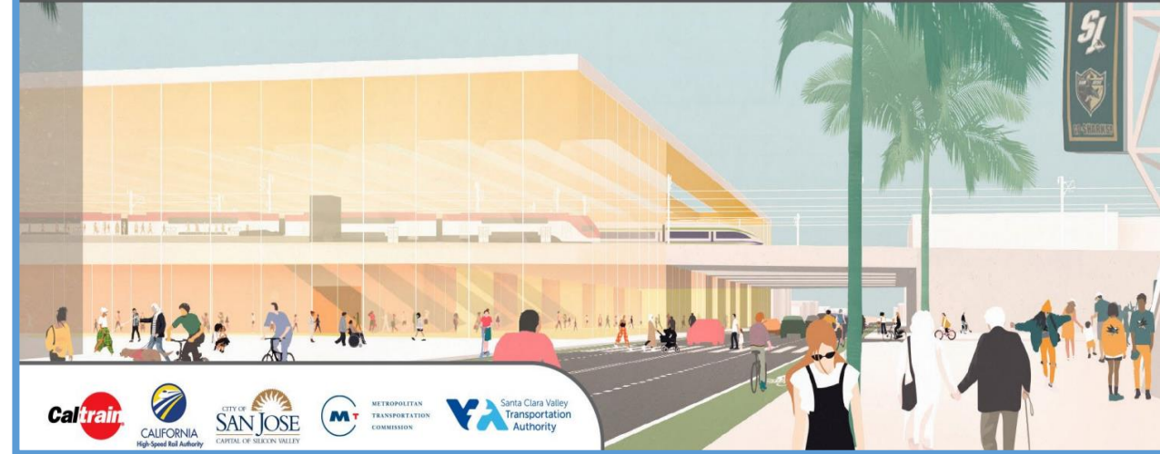
Source: Diridon Joint Policy Advisory Board, May 15, 2024, Agenda Item 6

* Diridon Co-Operative Agreement with Project Partners