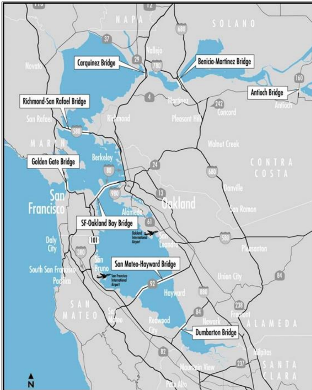
Map of BATA Bridge Toll Facilities

Note: Golden Gate Bridge is owned and operated by the Golden Gate Bridge Highway and Transportation District