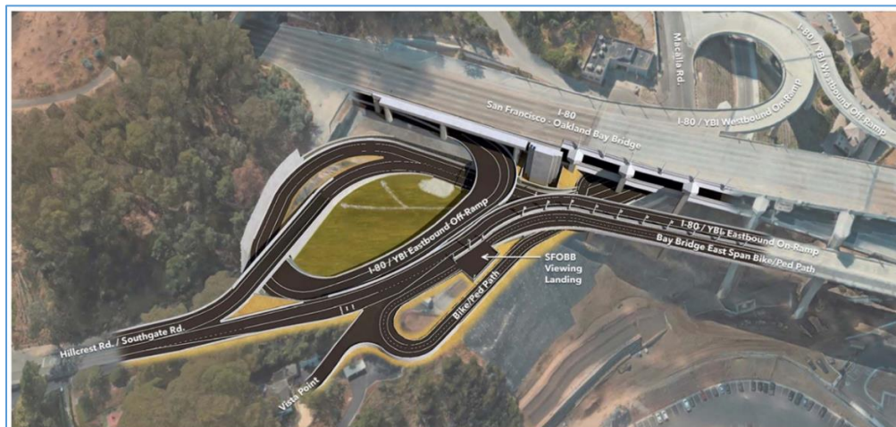
Illustration A: Completed Southgate Road Project

The Yerba Buena Island Southgate Road Realignment Project realigns the Interstate 80 eastbound off-ramp to Yerba Buena Island from the San Francisco-Oakland Bay Bridge (Bay Bridge) just past the tunnel and Southgate Road on the island to improve mobility for pedestrians, bicyclists, and vehicles. (See Illustration A, below.) Funding for the project was a combination of Federal Highway Bridge Program (HBP) funds with match from Proposition 1B and BATA Toll Bridge Seismic Retrofit and Rehabilitation Program funds. The SFCTA opened the new ramp in 2023.