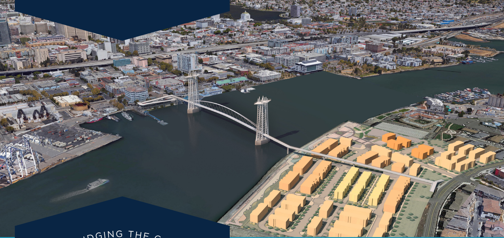
Rendering is for communications purposes; final bridge location is under evaluation.