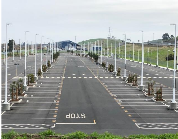
Expanded Antioch BART Parking Lot opened December 2021