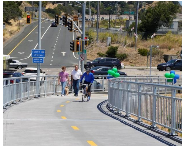
North-South Greenway Segment over Corte Madera Creek opened July 2022