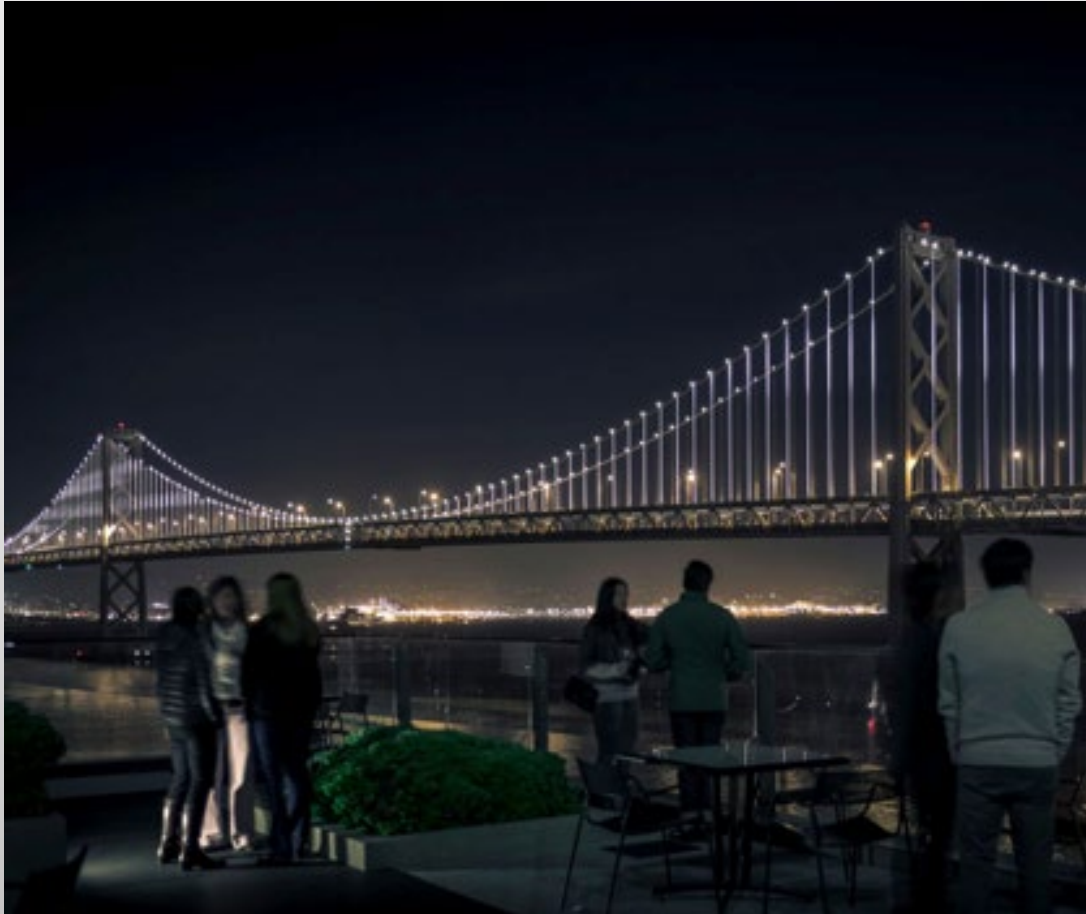
Graphic of Existing Bay Lights