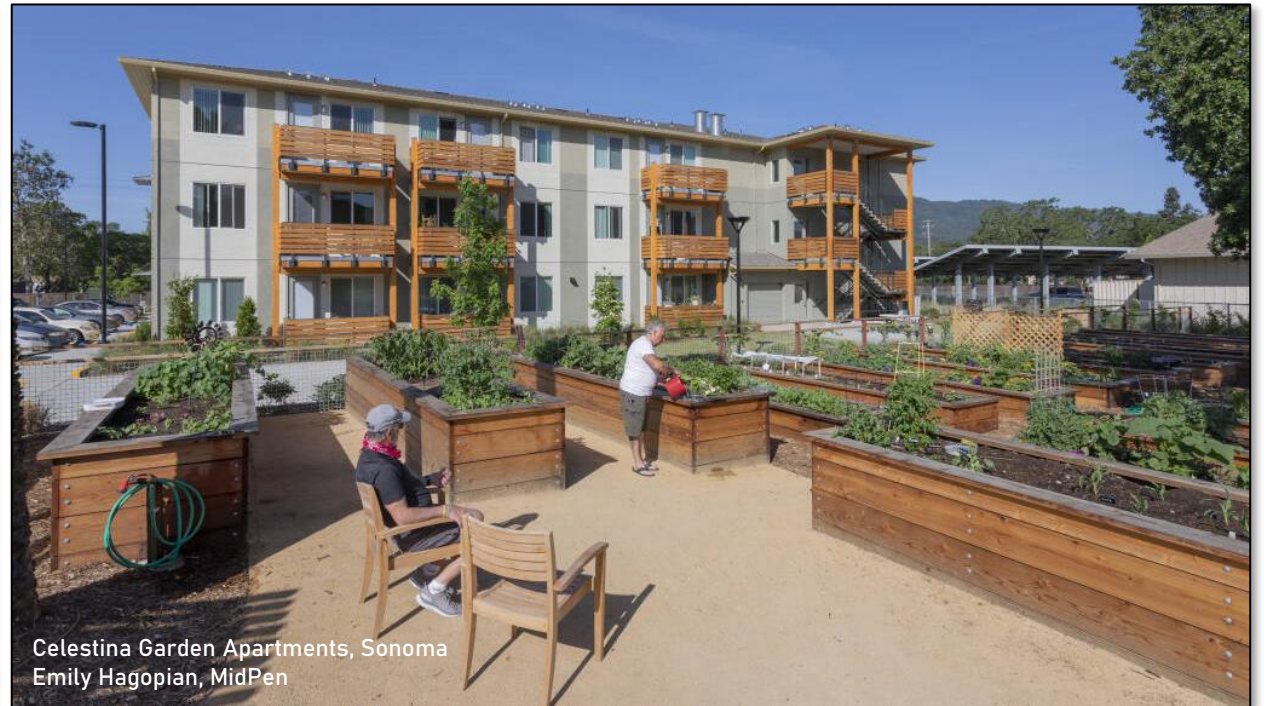
Celestina Garden Apartments, Sonoma