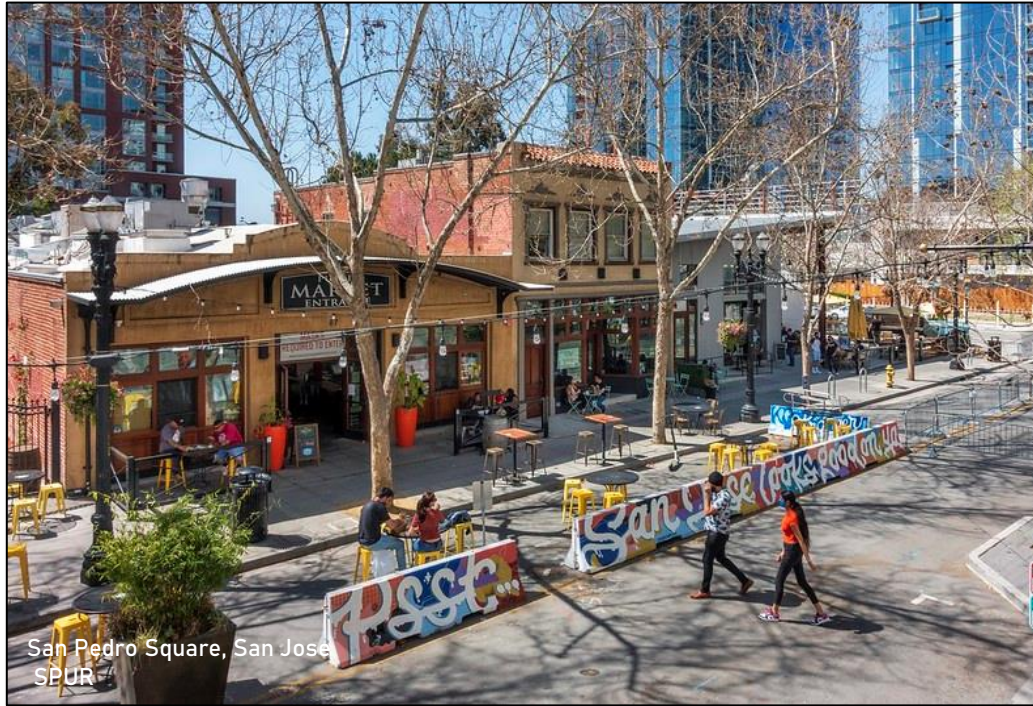
San Pedro Square, San Jose SPUR